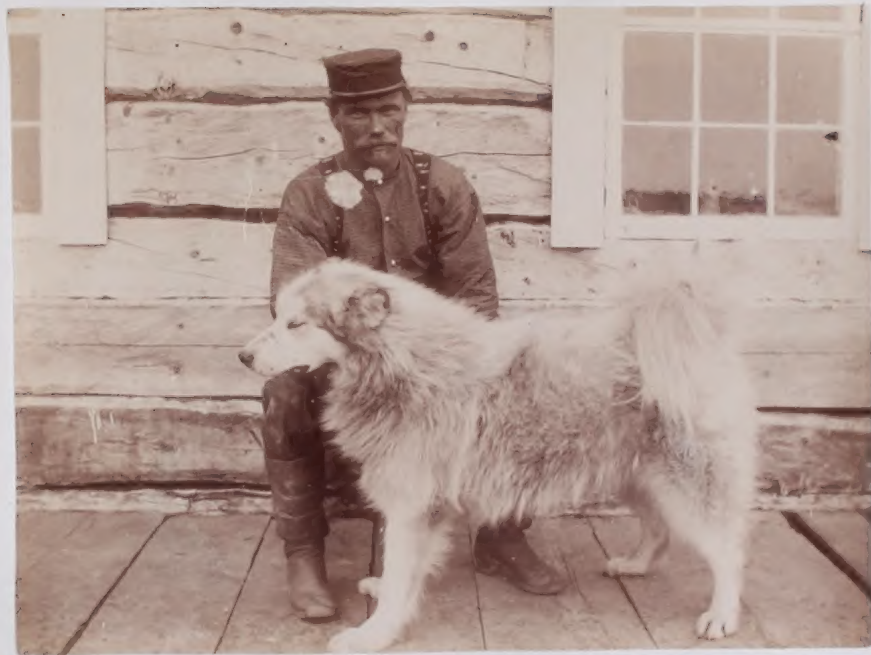
29. Esquimau dog.